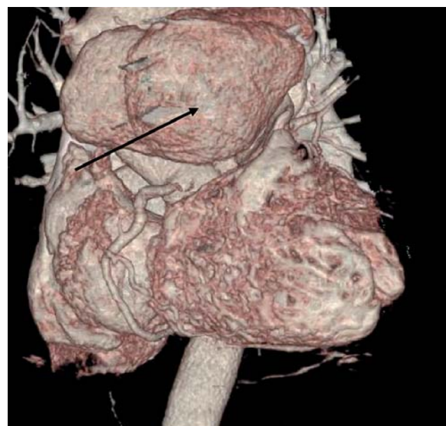
Fig. 2. Pseudoaneurysm originating in ascending aorta (suture line) with compression of pulmonary artery and right ventricle in patient 3